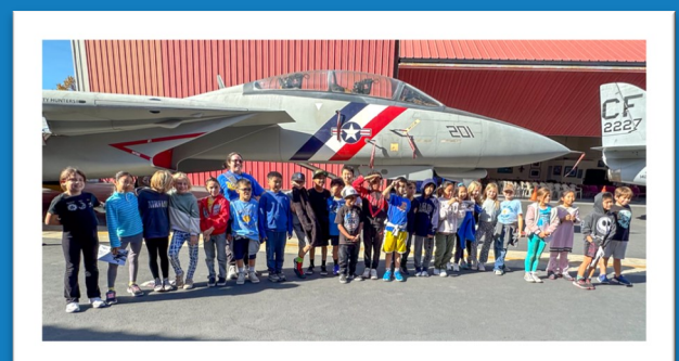
3rd grade Class attends “Kids Love Aviation Science”