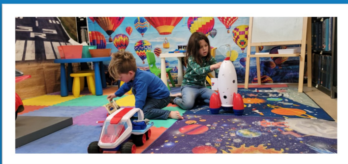
Children enjoy the Kids Aerospace Discovery Zone

➔ Questions or more information? Email Advancement@WMOF.com , or phone us at (310) 326-9544.