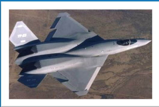
Northrop Grumman YF-23 “Black Widow” Stealth Fighter prototype on display at WMOF.

Mr. Kresa’s pledge is a 1:1 match. To receive the grant at the end of 2024, WMOF must raise $100,000 from new and current donors.